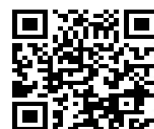
ST STEPHEN'S - use "Free Will Offering"