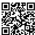
HOLY SPIRIT -use "Donations"